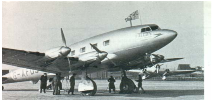
(Above) The second of Imperial Airways' five D.H.91s, G-AFDJ Falcon , at Croydon during the short pre-war period in which the type was operating on European routes. (Below) An obviously posed photograph showing the interior of an Imperial Airways Albatross, looking forwards.

Because of the outbreak of war, construction of military aircraft took the priority after September 1939, and these seven aircraft were the only D.H.91's built.